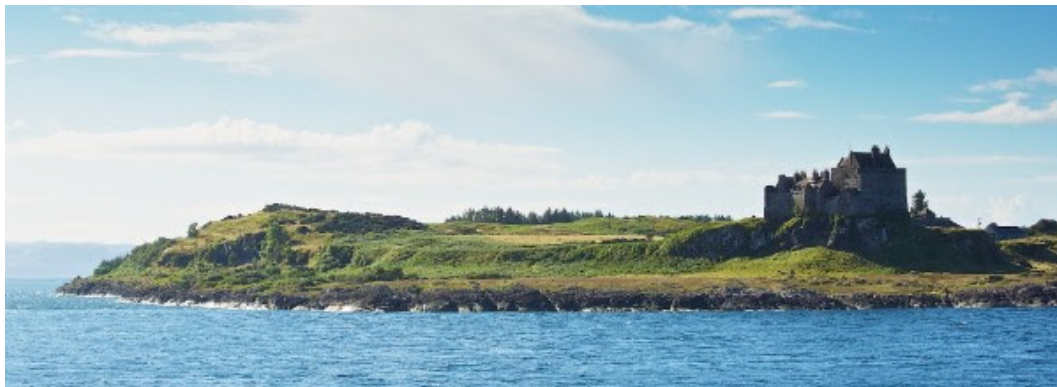
Castle Duart, seat of Clan MacLean (whose Chief is a patron of CASSOC)