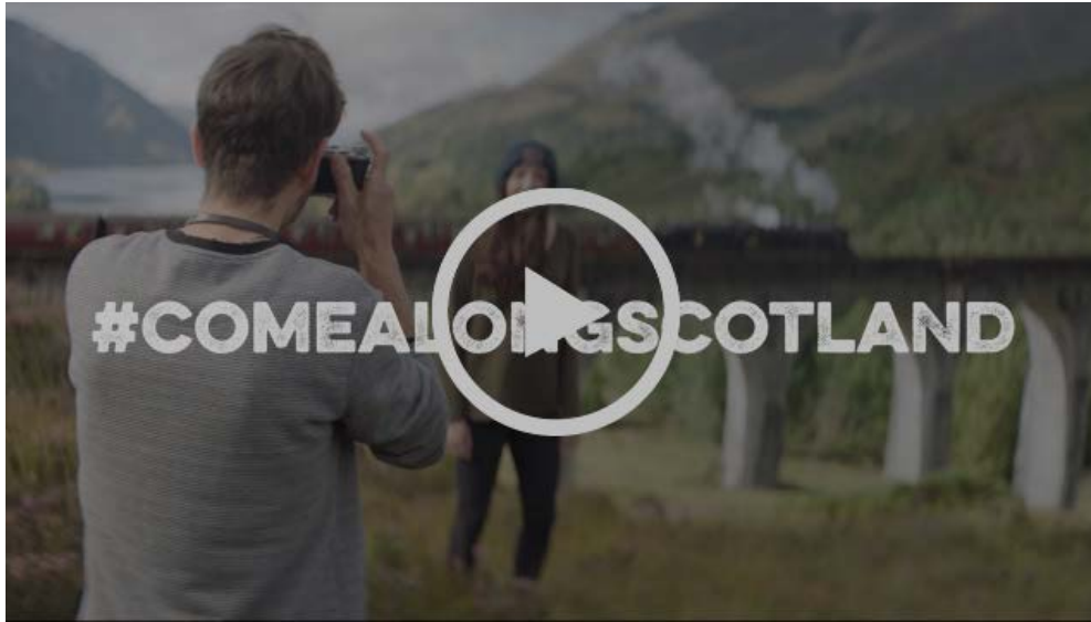
Scotland - Come Along