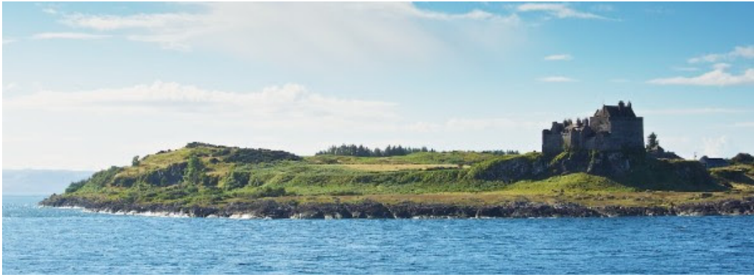
Castle Duart, seat of Clan MacLean (whose Chief is a patron of CASSOC)