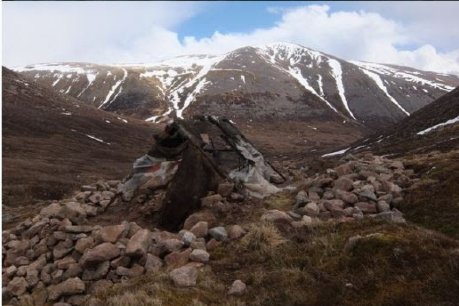
Top image Am Fear Liath Mòr