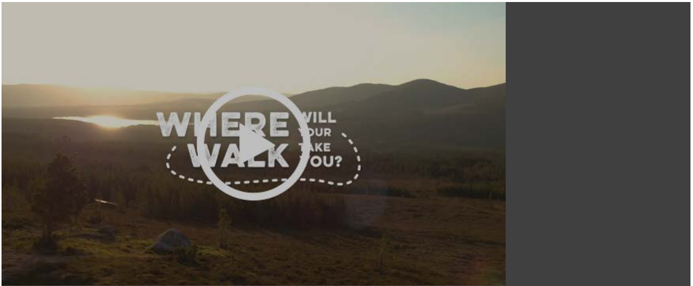
A Unique Perspective - Walking in Scotland, by VisitScotland