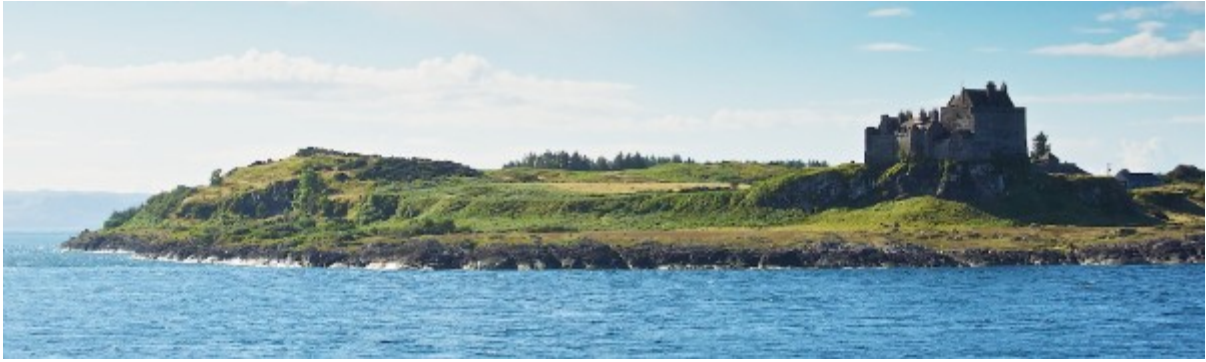
Castle Duart, seat of Clan MacLean (whose Chief is a patron of CASSOC)